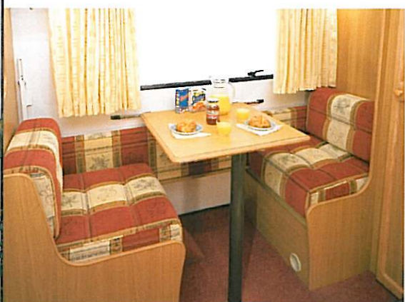
Rialto 550-4 side dinette in Orchid upholstery