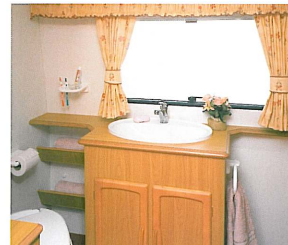
Rialto 550-4 washroom