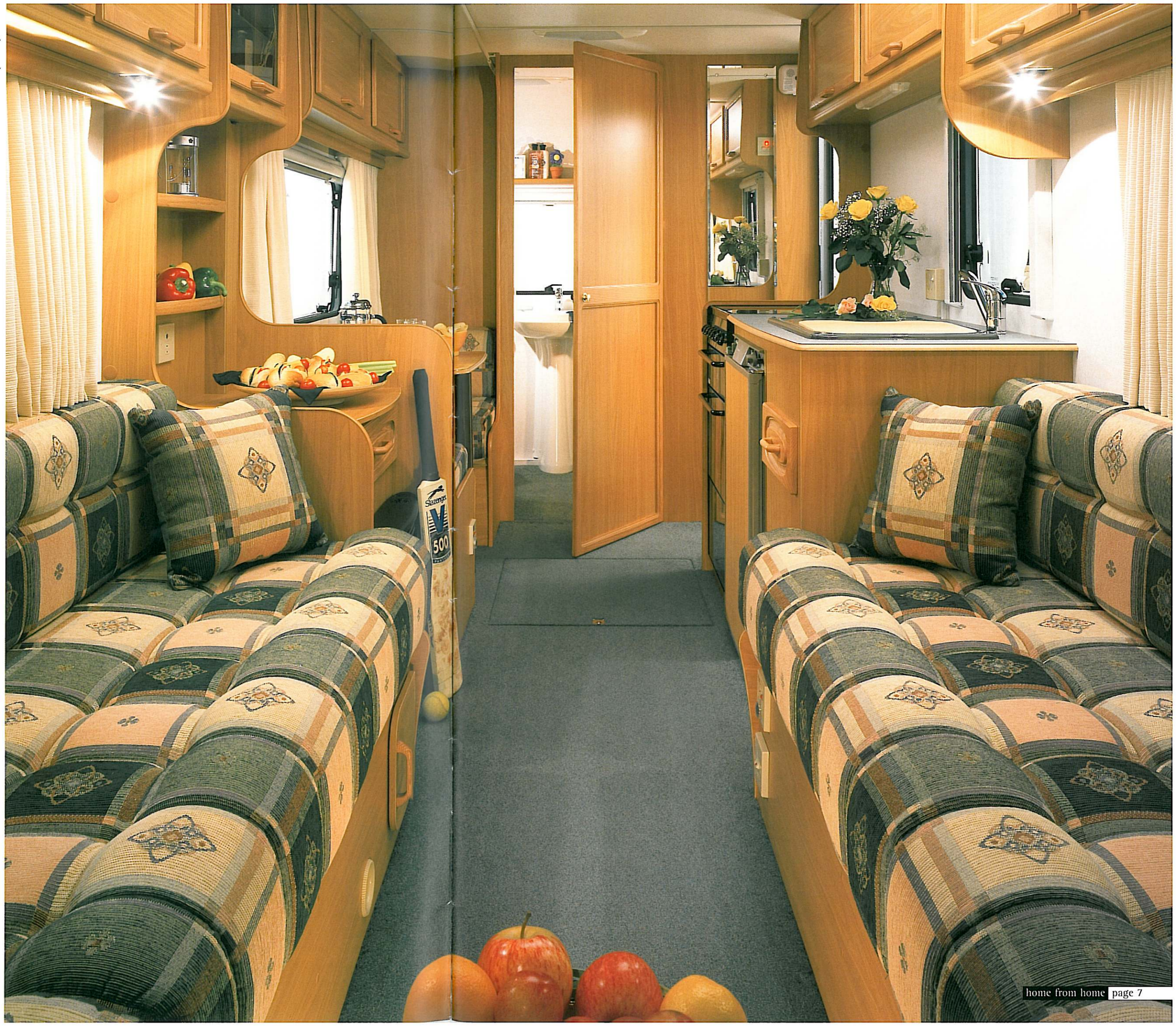
Dart 515-4 in Willow upholstery

Each of the five models in the Dart 2002 range is finished in Willow upholstery as standard. For customers wanting an alternative option, upholsteries from the other ranges are available for a small premium.