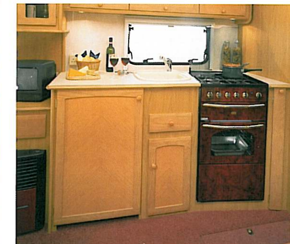
Land-Ranger 5500 kitchen