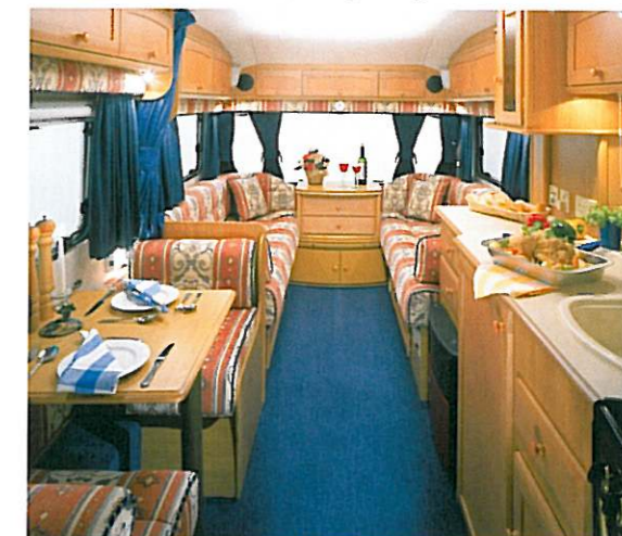
Avondale Osprey S in Windsor upholstery