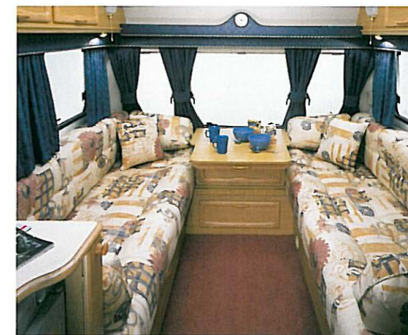
Rialto lounge in Springtime upholstery