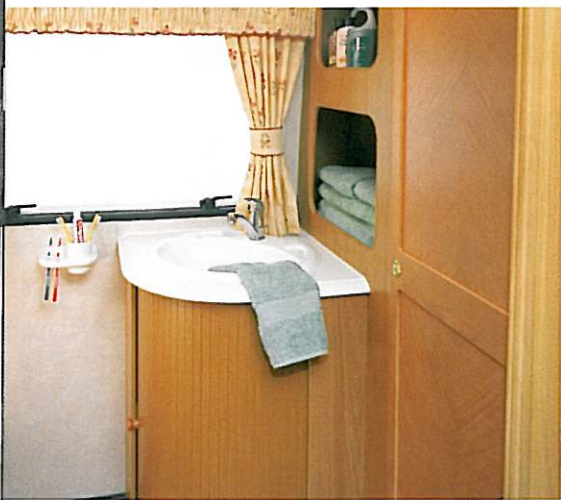
Land-Ranger 5500 washroom

Land-Ranger - the definitive twin axle tourer!