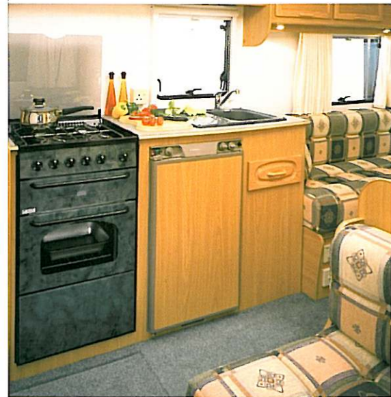
Dart 515-4 kitchen