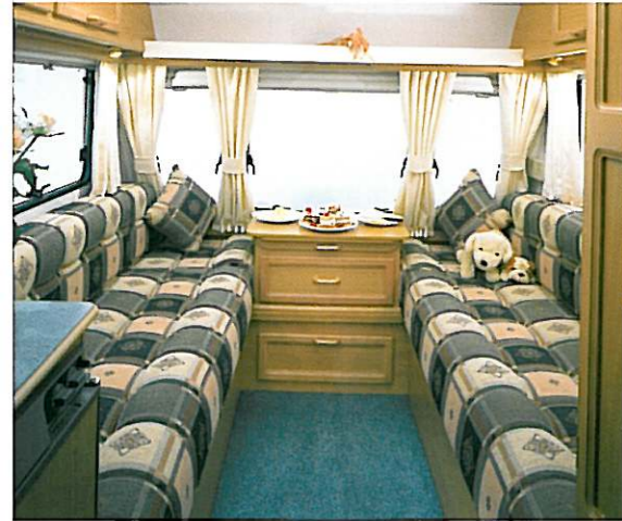
Dart 510-5 in Willow upholstery