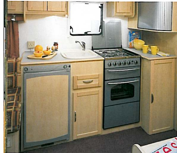
Argente 555-4 kitchen