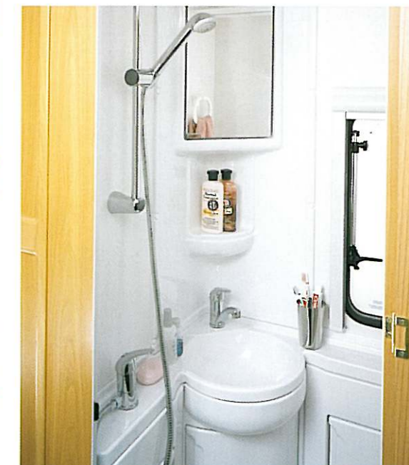
Dart 510-5 S washroom