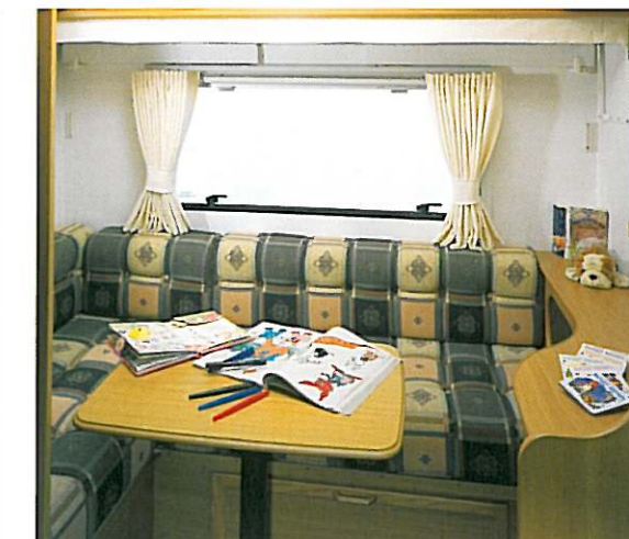
Dart 510-5 L rear dinette in Willow upholstery