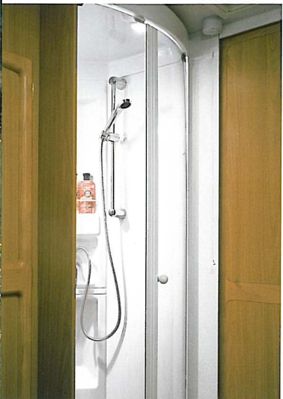
Rialto 550-4 shower cubicle