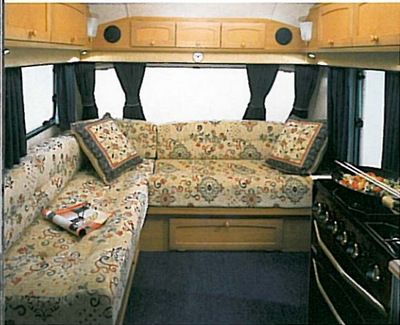
Land-Ranger 6400 EWL in Saffron upholstery