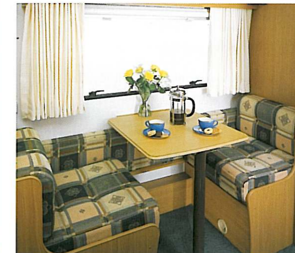
Dart 510-5 S side dinette in Willow upholstery