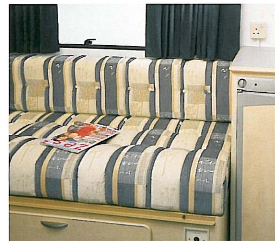
Argente in Malmö upholstery