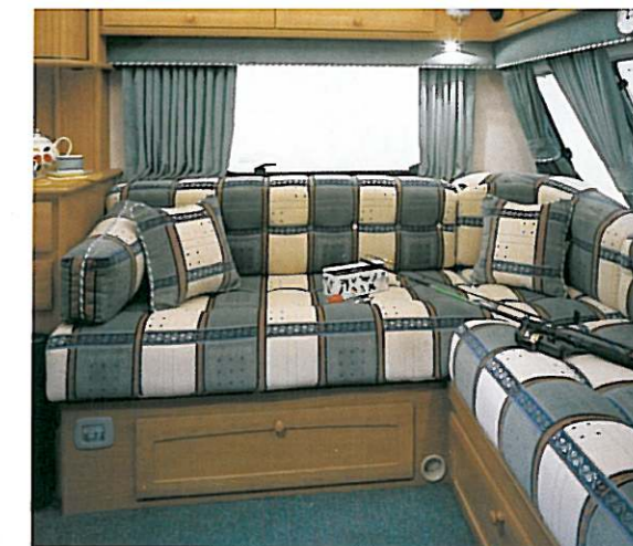
Avondale Avocet L in Buckingham upholstery