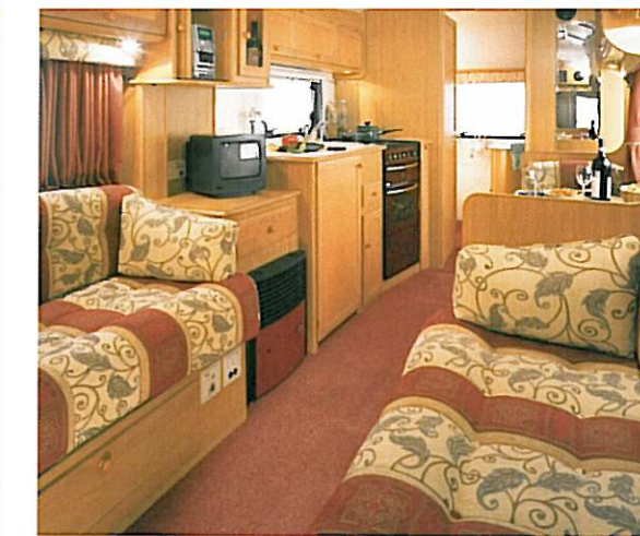
Land-Ranger 5500 S in Concerto upholstery