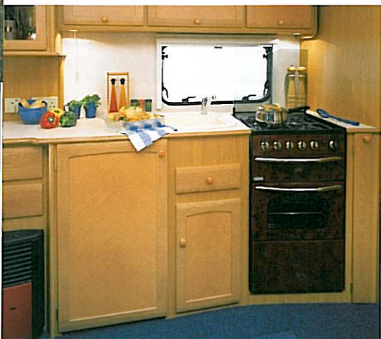
Avondale Osprey kitchen