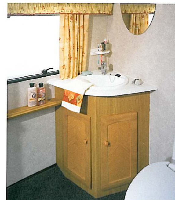
Avondale Avocet S and L washroom