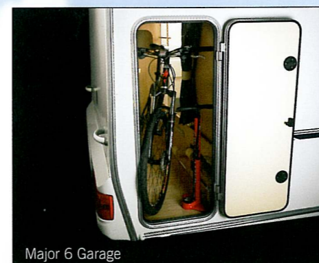
Major 6 Garage