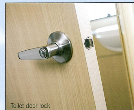
Toilet door lock