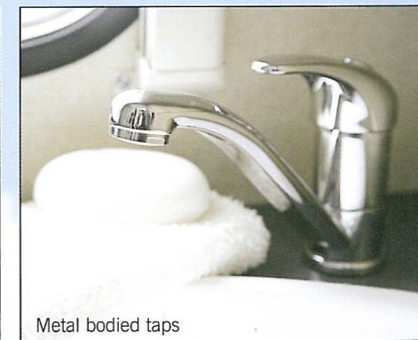
Metal bodied taps