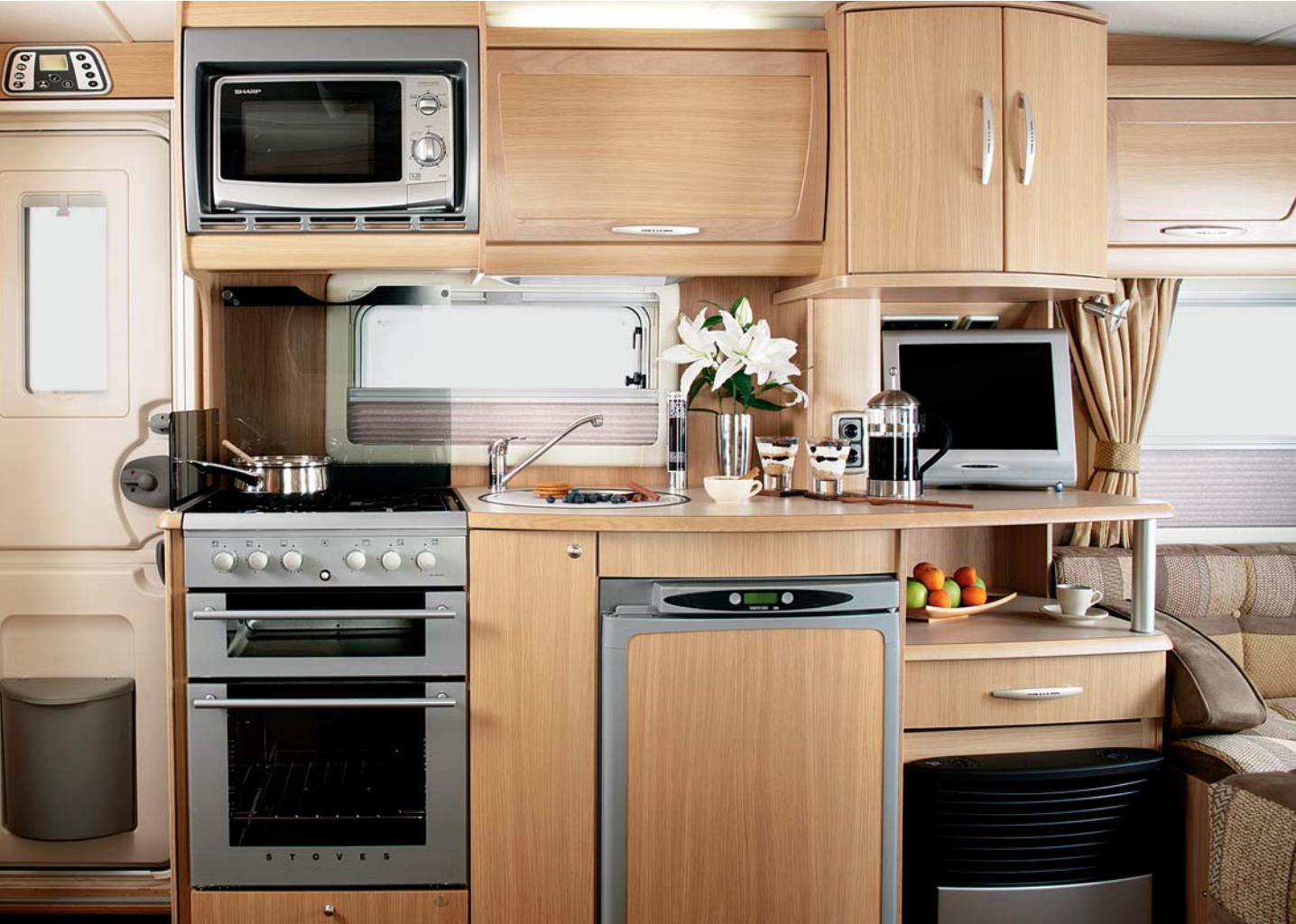
Below: Spectrum 416