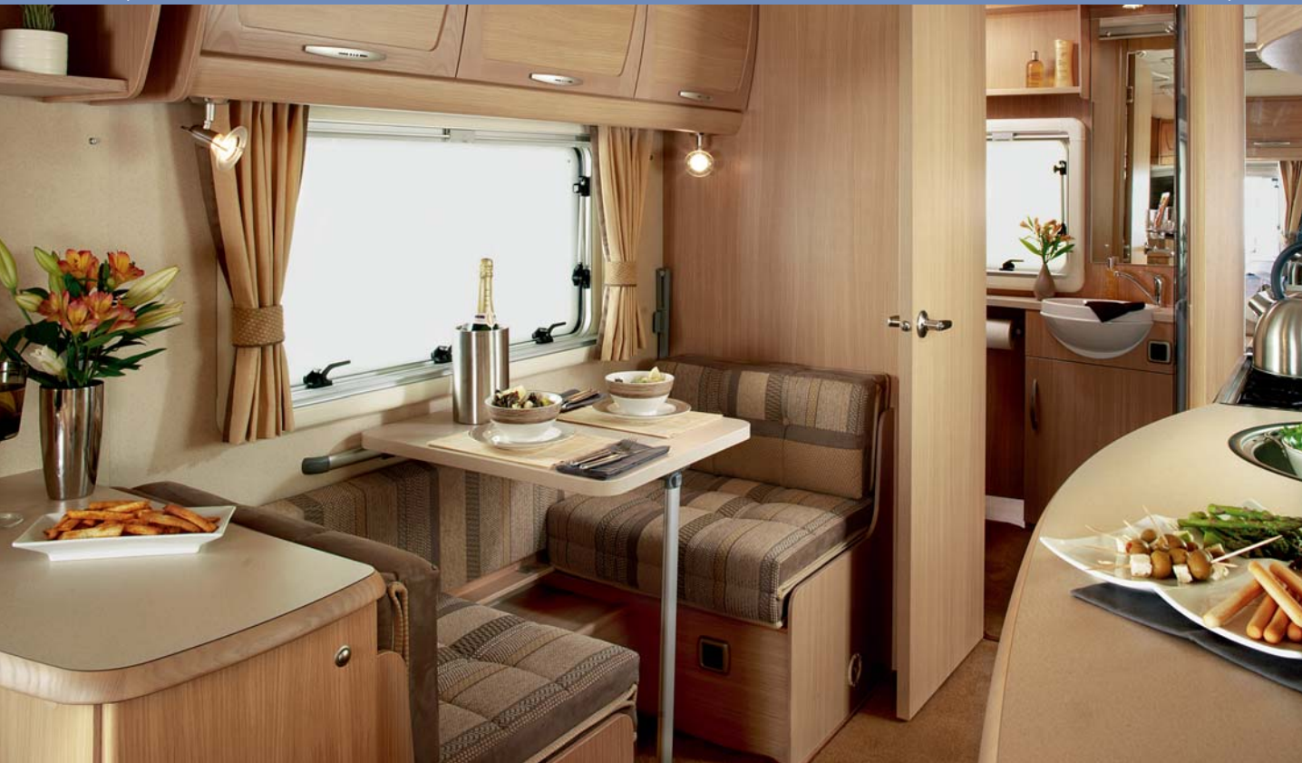
Above: Spectrum 416

The 215, 416 and 540 models offer luxurious walk-in showers with separate drying areas while other models feature fully-lined showers with glossy, easy-clean walls. Twin axle models enjoy Alde radiator-type central heating with 24/7 timer, while single axles benefit from dual fuel blown air systems.