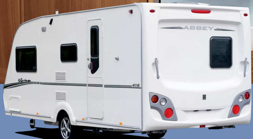
Left: Spectrum 416