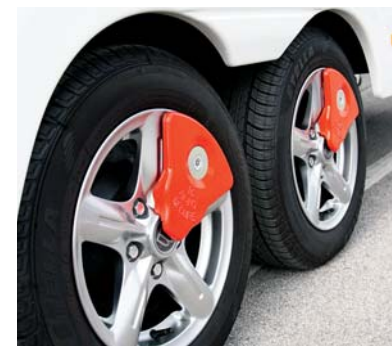
AL-KO wheel lock