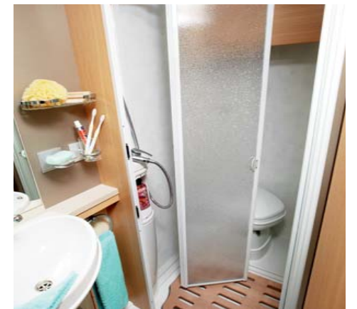
Above: E635 Right: E665 All models shown in this brochure are fitted with optional Elegance Pack

Three versatile layouts offer large lounging areas or, in the E665, a fixed bed, while fully equipped washrooms feature separate shower areas. The fully moulded luton houses a large double bed while the Fiat 4 tonne Maxi chassis offers generous payloads for all the holiday essentials.