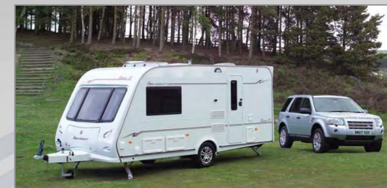
Buccaneer Elan 15