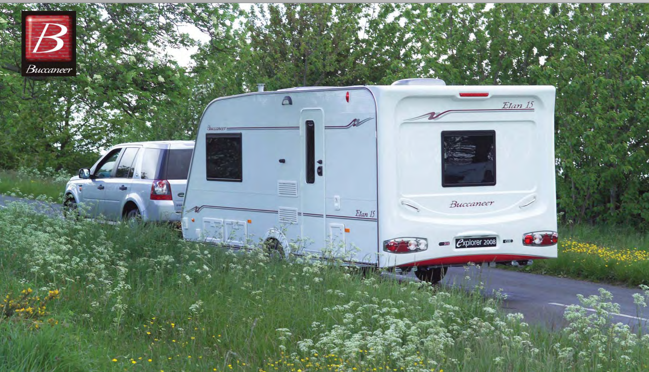
Buccaneer Elan 15