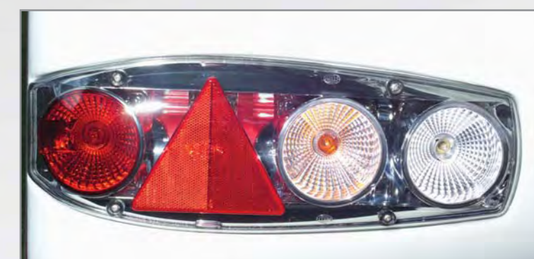
Buccaneer Rear Light Cluster