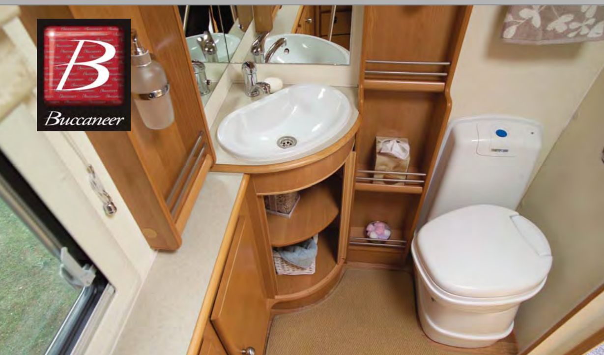
Buccaneer Elan 15