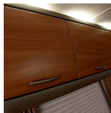
Concealed over-locker lighting