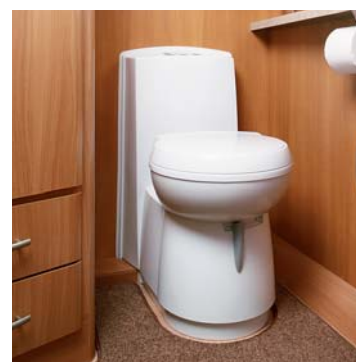
Latest Thetford toilet