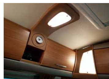
Front feature lighting