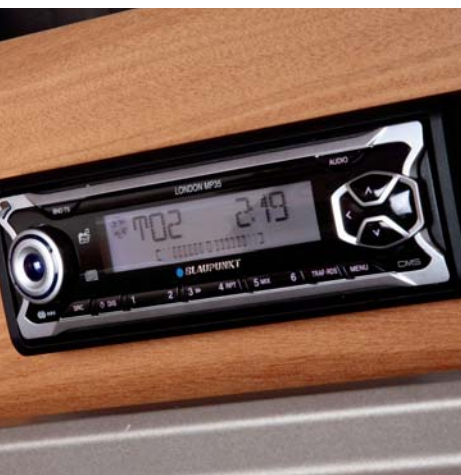
Radio/CD/MP3 Player (optional extra)