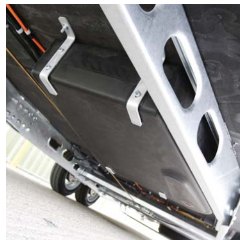
Insulated water tank (twin axle models)