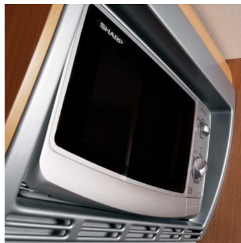
Microwave oven (optional extra)