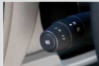
Cruise control Cruise control comes as part of new optional Elegance pack

Sophisticated interiors provide luxury as standard with new soft furnishings, upgraded sumptuous carpet and well-appointed kitchens and washrooms. Comfortable lounge space provides ample seating with handy storage space beneath that is easily accessible with gas strut assisted seat tops. Swivelling, fully adjustable driver and passenger seats can be used to add to the lounge area. A range of enhancements have been added to improve the living experience and the desirable feature list can be enhanced further with the updated optional hi-tech 'Elegance' pack.