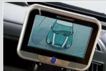
Reversing camera As part of optional Elegance Pack, colour reversing camera with infra-red night vision

The E540 model has been lengthened from 6.54m to 7.04m to offer longer seating and single beds and a new spacious walk-in washroom. All washrooms feature a separate shower area or cubicle, an electric flush cassette toilet and handy storage space with washbasins neatly integrated into a useful cupboard unit and an overhead storage locker. The E530 layout has also seen the same increase in length to allow for more central space and a new 175 litre Smart Energy Selection fridge freezer. For those who want a more compact model that is easy to drive and manoeuvre, the E510 is ideal at less than 6m long.