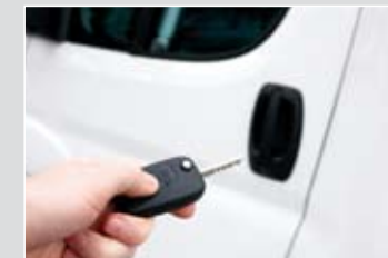
Remote locking New remote central locking of cab doors and entrance door

The E540 model has been lengthened from 6.54m to 7.04m to offer longer seating and single beds and a new spacious walk-in washroom. All washrooms feature a separate shower area or cubicle, an electric flush cassette toilet and handy storage space with washbasins neatly integrated into a useful cupboard unit and an overhead storage locker. The E530 layout has also seen the same increase in length to allow for more central space and a new 175 litre Smart Energy Selection fridge freezer. For those who want a more compact model that is easy to drive and manoeuvre, the E510 is ideal at less than 6m long.