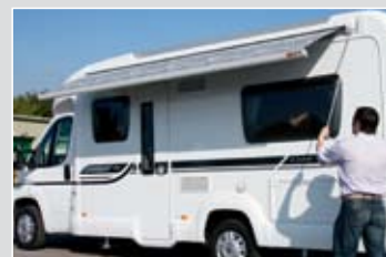
Awning Full-length canopy awning now comes as standard