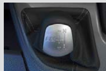
Automatic gearbox Optional 160 bhp engine with Comfort-Matic automatic gearbox