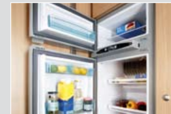
Fridge freezer New 175 litre Smart Energy Selection fridge freezer (104 litre on E510)