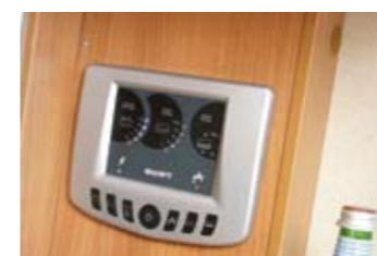
Control Panel The 12V control panel controls the 12V power on/off, water pump and lighting circuits, tank levels and leisure battery state

Based on the Fiat Ducato, the Escape comes with a 100 MJ engine as standard which provides class-leading power and performance for this low weight range. The cab is dark Imperial Blue with complementary Escape graphics to the gloss white one-piece, thick gauge aluminium side walls which are finished with GFR moulded skirts and ABS lower rear panel with stylish light clusters to give an overall striking appearance. The cab offers the high level of specification you would expect from a quality coachbuilt motorhome.