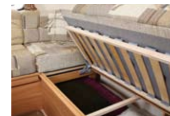
Beech slatted seat top Spring assisted for easy access

Inside is equally well appointed with furniture in Tanganyika medium walnut finish which tones perfectly with a warm beige and grey fabric scheme. Good storage is provided with beech slatted seat tops being sprung assisted for easy access to storage areas below (except travelling seats). Well-equipped kitchens offer an 80 litre fridge and a combined thermostatic oven and grill, both with electronic ignition. Washrooms have a 35mm thick entrance door with domestic style mortice lock and handle plus the latest Thetford C250 toilet with electric flush and wheeled holding tank.