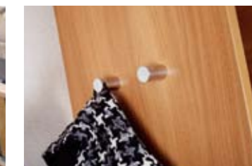
Stylish Coat Hook Thoughtful finishing touches for everyday living