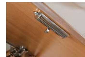
Positive catches Positive catches on all furniture doors provide secure storage, even whilst on the move

Inside is equally well appointed with furniture in Tanganyika medium walnut finish which tones perfectly with a warm beige and grey fabric scheme. Good storage is provided with beech slatted seat tops being sprung assisted for easy access to storage areas below (except travelling seats). Well-equipped kitchens offer an 80 litre fridge and a combined thermostatic oven and grill, both with electronic ignition. Washrooms have a 35mm thick entrance door with domestic style mortice lock and handle plus the latest Thetford C250 toilet with electric flush and wheeled holding tank.