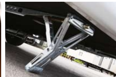
Heavy duty corner steadies