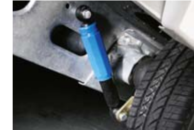
Shock absorbers Give more stable, smooth towing