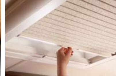
Pleated Heki blind Easy action pleated blind provides shade for day or night