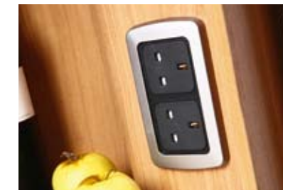
Twin socket Models now feature five 230V sockets to cater for modern requirements