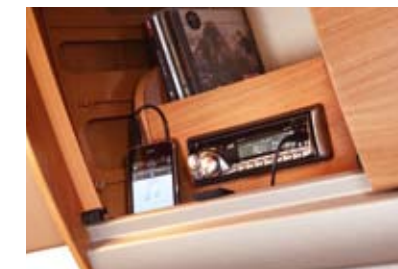
Radio/CD/MP3 player Radio/CD/MP3 player with iPod/MP3 player connection