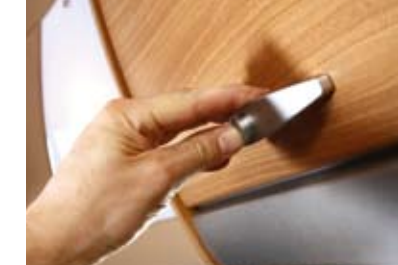
Postive locker catches For secure storage on the move

Awning sizes: Due to the varying awning designs and sizes the awning sizes given are approximate only. Specific awning sizes must be confirmed by your dealer or the awning manufacturer prior to purchase.