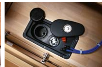
Water tank 40L underfloor insulated fresh water tank (twin axles only)