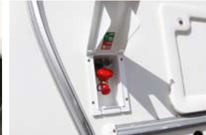
BBQ point For alfresco cooking