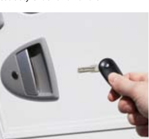
Enhanced security complete with flipper