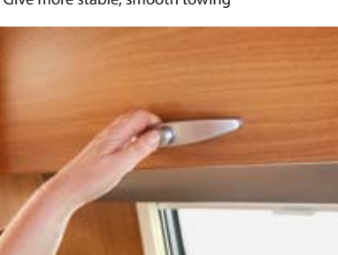
Positive locker catches On kitchen lockers for secure storage on the move