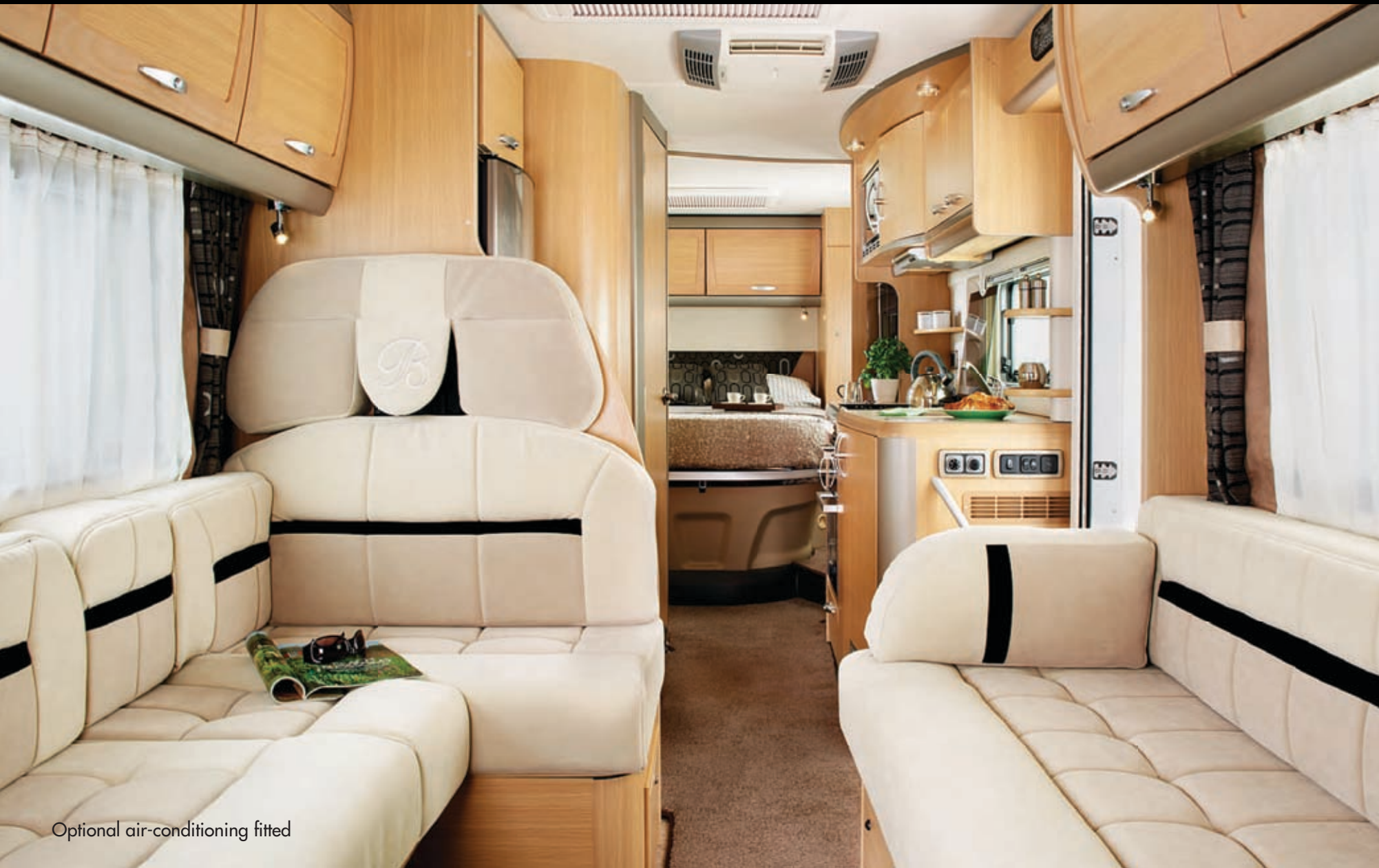
Optional air-conditioning fitted