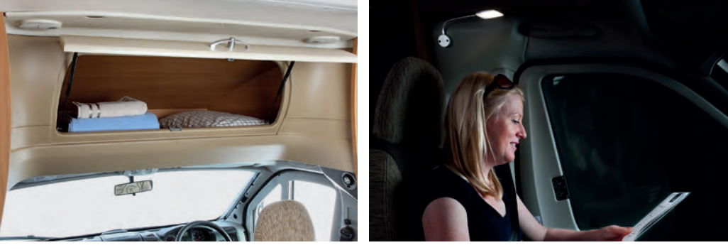
☆ Large overcab locker with space for bedding (Low-line models only)