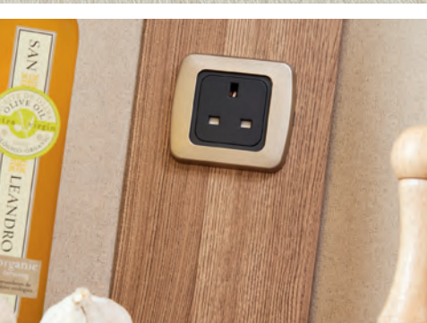
\stackrel{\scriptstyle <}{\phantom{}_{\sim}} Four or five 230V sockets to meet modern demands

☆ Digital control Smart Energy Selection fridge with electronic ignition