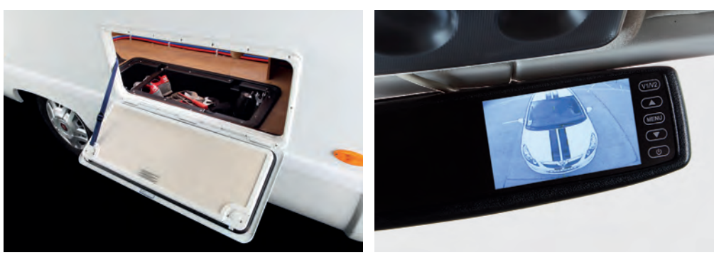
☆ Useful under floor storage bin (E450, E460, E495)