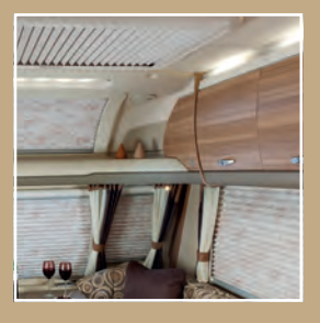
Low energy lighting system throughout with ambient over-locker lights and LED task lights