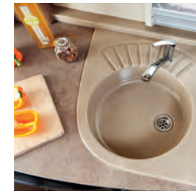
Stylish and practical granite effect sink with removable drainer BBQ point for alfresco cooking