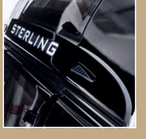
Rain water deflector over front windows for a clearer view out