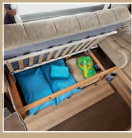
construction, full front access and space for larger items