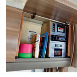
power management for easy access