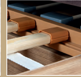
Seat bases with spaceframe New bed make-up system with slats retained on track