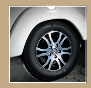
Hankook tyres with a minimum of 150kg extra load margin for improved performance and safety on stylish alloy wheels