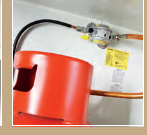
Gas regulator with stainless steel braided hose for improved reliability