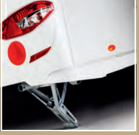
Heavy duty rear corner steadies and profiled skirts