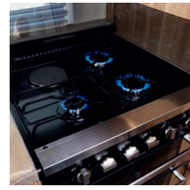
Microwave oven with digital controls built in at an easily accessible level Dual fuel hob with 800W electric hotplate and 3 gas burners and separate grill with glass-fronted oven