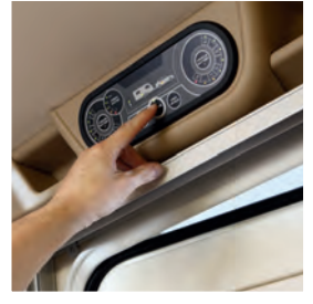
User friendly 12V control panel Locker mounted eye level set in moulded housing with key shelves