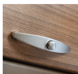
Positive locker catches for secure storage on the move