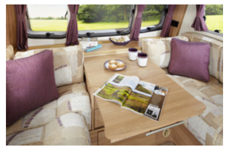
Optional chest of drawers unit with slide out occasional table