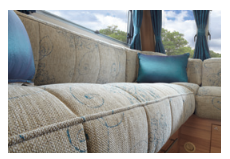
Optional Gershwin upholstery