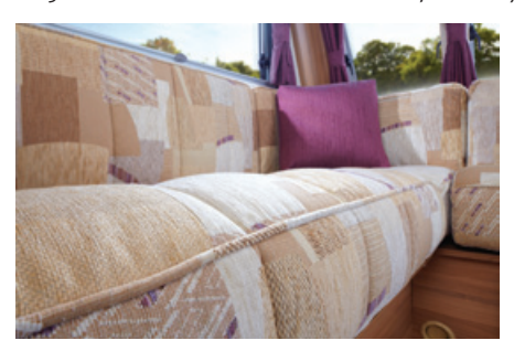
Standard Vivaldi upholstery