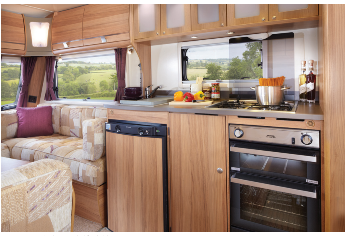
Pegasus Ancona in standard Vivaldi upholstery