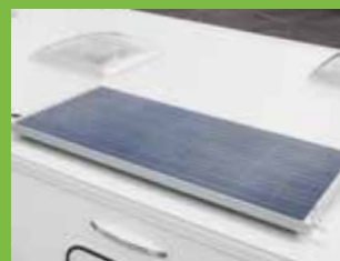
100W Solar panel