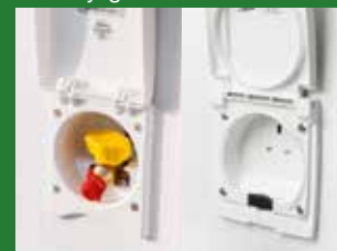
BBQ point and external 230V mains socket