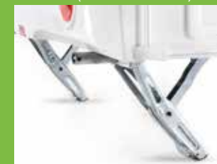
Heavy duty corner steadies (twin axle models)