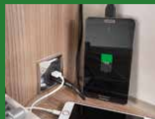
New Double USB charging point