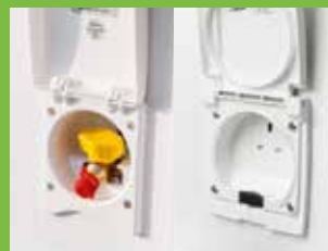
BBQ point and external 230V mains socket