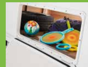
External access door to front nearside (excludes Q6EW)