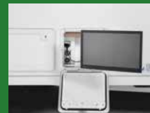
New External entertainment hatch (TV not included)