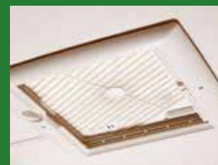
Omnivent 3-speed fan and skylight