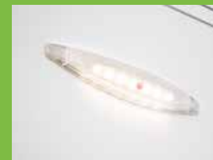
Alarm with key fob awning light control