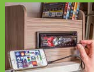
Radio/CD/MP3 player with iPod connection