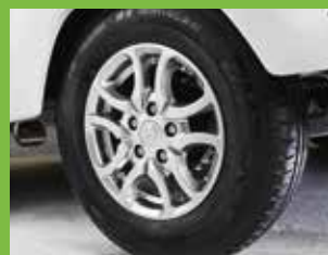
Scorpion alloy wheels