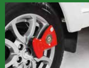
AL-KO Secure wheel lock