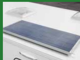
100W Solar panel