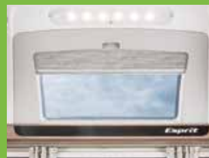
Panoramic front sunroof and blind with Esprit logo