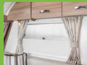
New Horrex window blinds