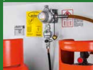
New Truma Duo comfort crash sensor change over regulator