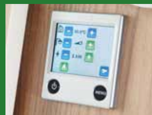
Alde central heating with washroom radiator