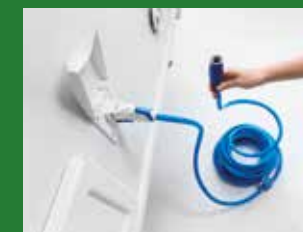
New Truma Waterline