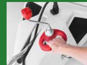
New AL-KO manoeuvring handle