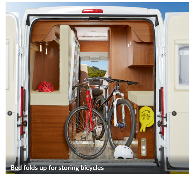
Bed folds up for storing bicycles