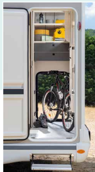
Multipurpose rear space: garage and storage