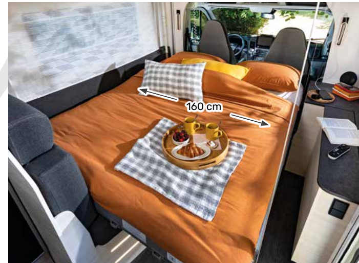
Electric drop down bed