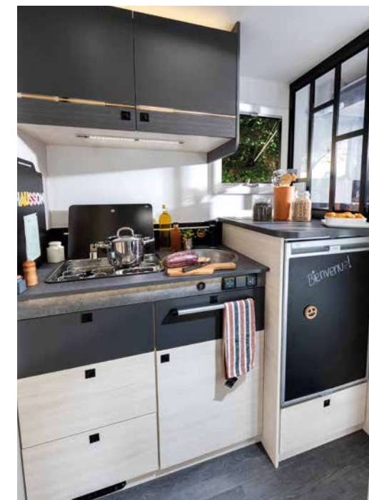
Kitchen with glass wall