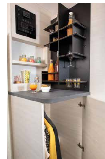
At the entry, a storage for glasses and bottles and a wardrobe