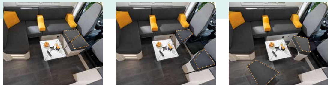
U or L-shaped living room suitable for up to 8 people