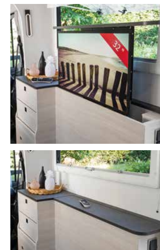
32" TV retractable mount