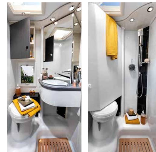
Bathroom with swivel partition