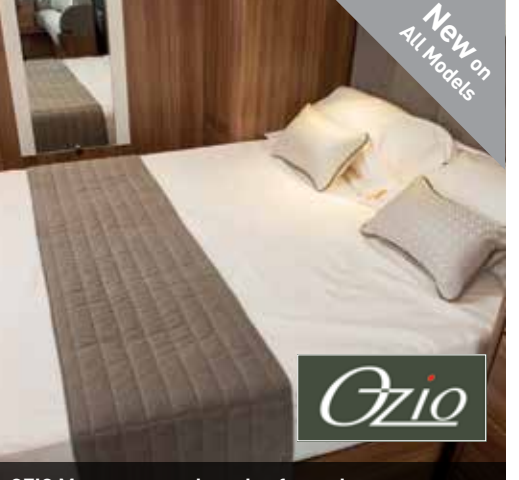
OZIO Mattresses and seating for optimum comfort, support and pressure relief