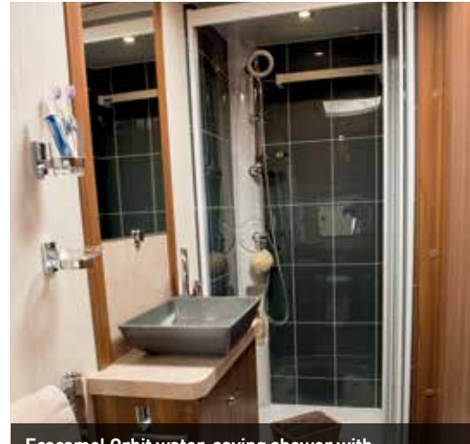
Ecocamel Orbit water-saving shower with Aircore technology