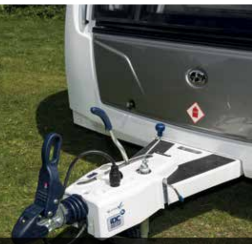
BPW Swing V-tec chassis with iDC and Diamond Standard wheel locks