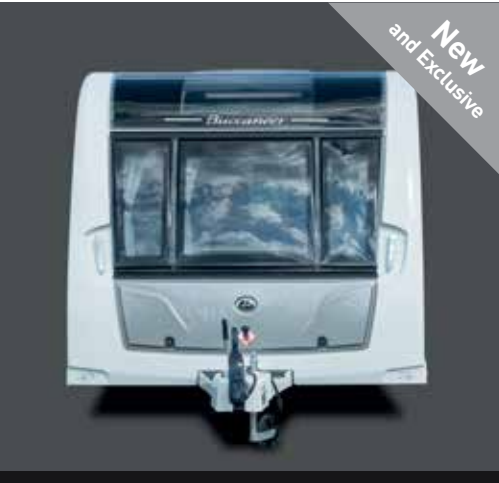
8ft Overall width - a first for any UK caravan manufacturer!