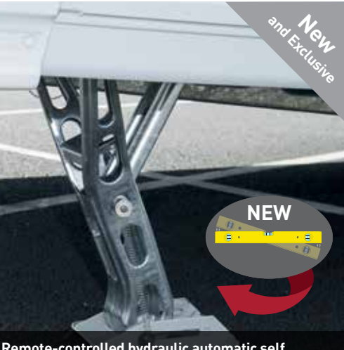
Remote-controlled hydraulic automatic self levelling system - works in just 2 minutes