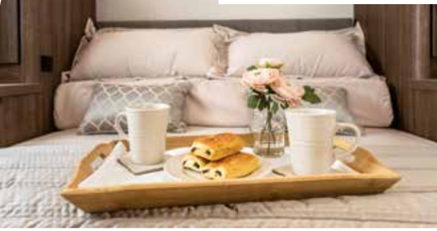
OPTIONAL: CO-ORDINATED BEDDING SET AVAILABLE

ActivCare® Technology Compass Avantgarde Marrakech fabric benefits from ActivCare. Premium quality stain free technology.