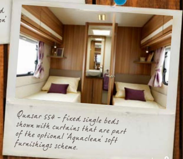
Quasar 554 – fixed single beds shown with curtains that are part of the optional 'AquaClean' soft furnishings scheme.