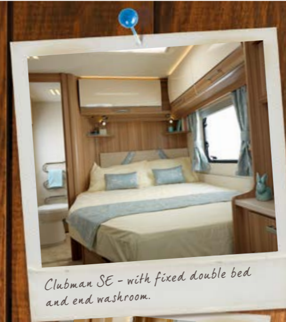
Clubman SE - with fixed double bed and end washroom.