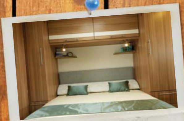
New Quasar 574 – with transverse island bed with 'Easy Action' day/night mode.