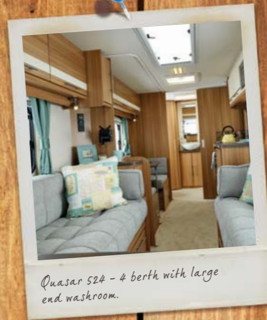
Quasar 524 – 4 berth with large end washroom.

5. New stainless steel circular sink (not Ariva) and new 'Bamboo Rain' texture splashback.