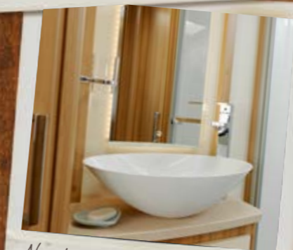
New top mounted bowl (model specific) and new vanity unit with LED back lighting.