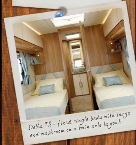
Delta TS - fixed single beds with large end washroom on a twin axle layout.