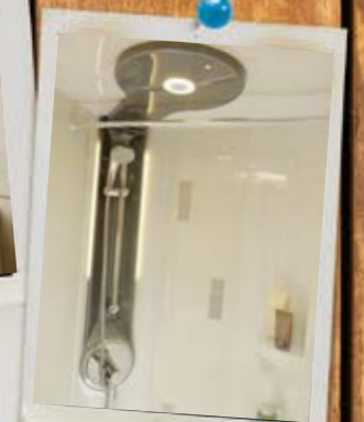
Restyled shower unit with decorative riser bar, LED lighting and decorative panel.