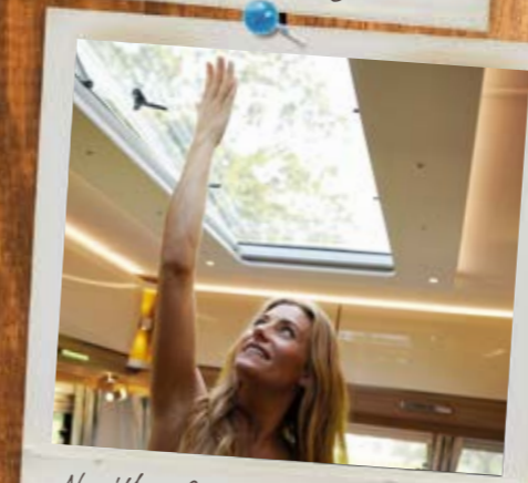
New 'Maxi Skyview' rooflight.