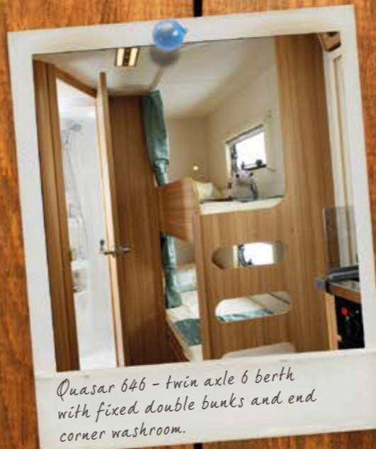
Quasar 646 – twin axle 6 berth with fixed double bunks and end corner washroom.