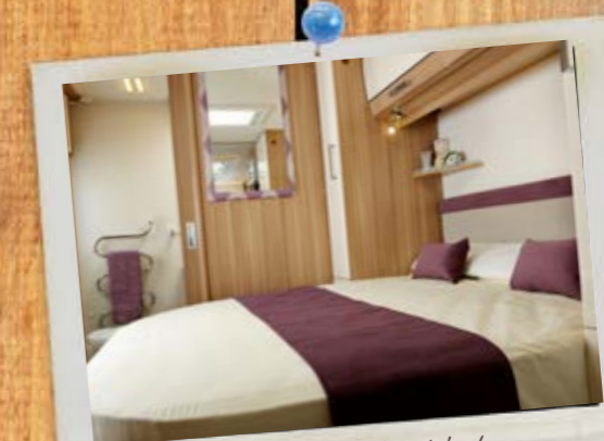
Delta TI - transverse island bed with 'Easy Action' day/night mode. Displayed with headboard and mirror frame in colour scheme that's part of the optional 'AquaClean' soft furnishings.