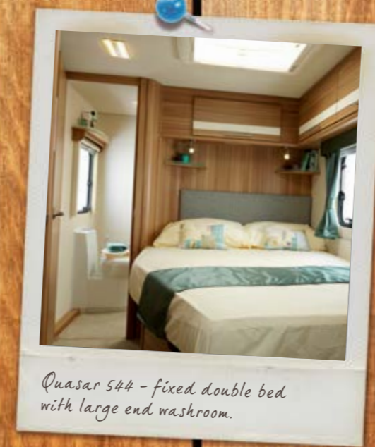
Quasar 544 – fixed double bed with large end washroom.