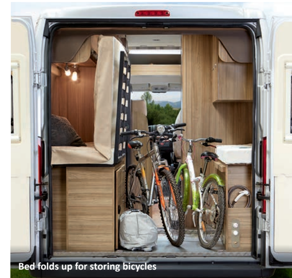
Bed folds up for storing bicycles