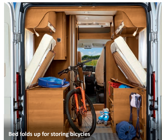
Bed folds up for storing bicycles