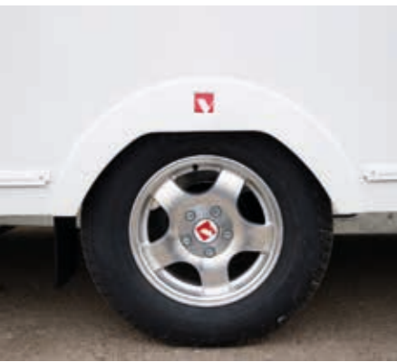
Venus 460/2 Venus 540/4 Venus 550/4 Venus 580/6 Venus 620/6