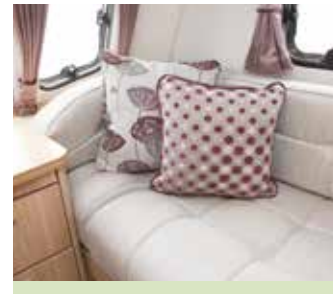
Luxury Coachman Laser fabric scheme and deeply-curved armrests for extra comfort