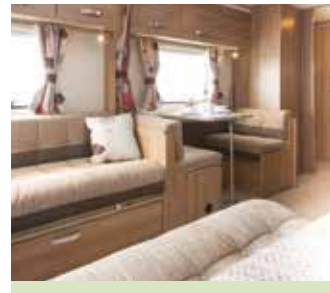
The unique fabric scheme, called "Kitami", gives the Coastline Esprit a luxuriously stylish look

Coastline Esprits all have sunroofs. They all have the Sprite Diamond Pack. This provides a hitchhead stabiliser, an AL-KO Secure wheel lock receiver (two on twin-axle models), a microwave, radio, two cushions, alloy wheels and a door fly-screen.