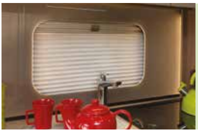
An acrylic kitchen splashback panel with concealed LED lighting set on each side, subtly illuminating the whole panel