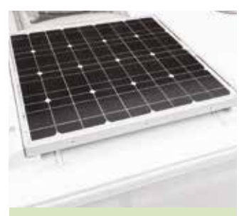
The solar panel, mounted on the roof, is part of the package of extras

The family-layout twin-axle Q6 FB has two more features than the other Coastline Esprits. These are heavy-duty corner steadies and a second set of television connection points, so that the occupants of the double bed can enjoy the luxury of TV watching; connections and a bracket, are on the bedroom wall.