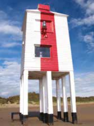
Burnham-on-Sea's famous nine-legged lighthouse; the resorts coastline close to Highbridge inspired the name Coastline

The Coastline Esprits are based on the Swift Group's Sprite range, with extra equipment and a totally different look. Esprits have an exclusive fabrics scheme. They also have alarm systems, with key fob activation which also controls the awning light.