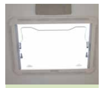
A full-size Heki panoramic rooflight replaces the Midi Heki on the standard model

The 580/5 with bunk beds The twin-axle family sixberth 640/6