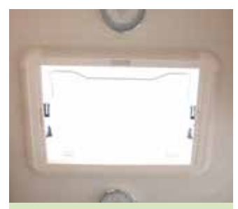
Over the lounge, Conquests have the large Heki rooflight instead of the Midi Heki

light emitting from both ends of their cylindrical shape. This is a feature which also appears in Clubmans, as is the ceramic-lined toilet, and the offside light that gives you illumination when you are carrying out the water tasks.