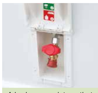
A barbecue point, so that you can take gas from your caravan cylinder to your barbecue

sunlight, giving this distinctive pale fabric a sparklingly bright look. Mauves and purples, regarded as the current caravan fashion statements, appear in curtains and cushions. The whole look is bright, light and classy. Armrest shapes, too,