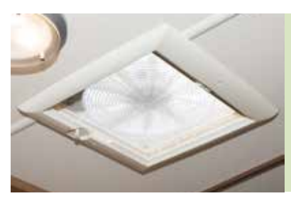
An Omnivent extractor fan, with three speed options, plus a twoway facility, so that it can be used to intake air or to extract steam and cooking aromas