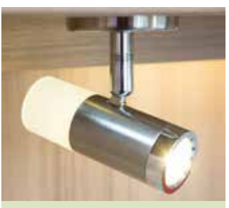
The spotlights have lights at each end, with both a directional beam and a more diffuse light

cylinder changeover system. There's an alarm system, with a key fob remote control that also activates the awning light. Conquests also have shock absorbers, which reduce vibration caused by uneven road surfaces.