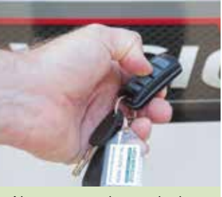
Also among the exclusive Design Edition features is an alarm system with keyfob control

The Vision brand started its life at Highbridge Caravan Centre, as a special edition. It went on to become Coachman's important new range, launched in 2014. Now, Vision is back to its roots, in a very special new Design Edition.