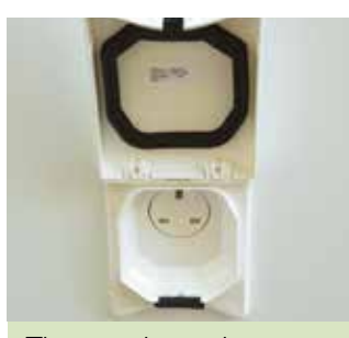
The exterior mains socket enables you to power a table lamp in your awning, for example

For 2015 a new range of Coastlines has arrived at Highbridge, called the Sprite Coastline Esprit.