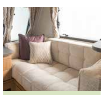
The "Sarona" soft furnishings scheme comes from the Lunar Clubman range

► The six-berth FB, with fixed bunks and end washroom